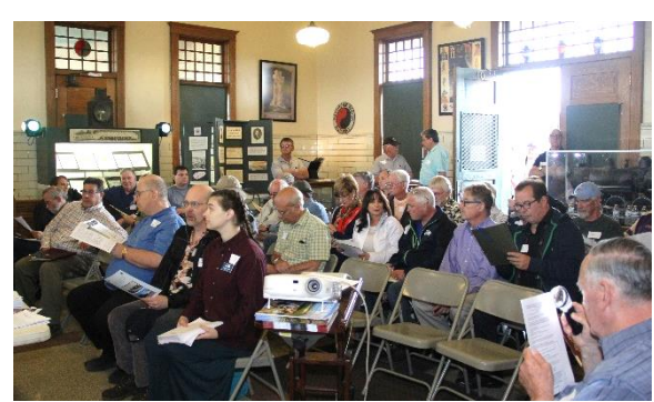
Seventy-five people attended the All Aboard Washington meeting in Toppenish on May 14 to support efforts to return passenger rail service to the Yakima Valley and beyond.