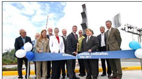
July 8 ribbon cutting for the improvements to the Edmonds Sounder/Amtrak station platform, transit and parking areas.