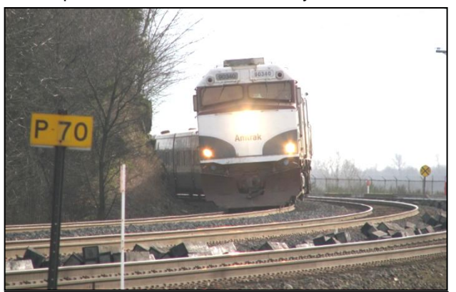
An Amtrak Cascades train rolls north at Kalama, WA in February 2010. This segment of the Seattle-Portland BNSF mainline is part of the Kelso to Martins Bluff project where passenger train speeds, with proper funding, could be boosted up to 110 mph in the future.