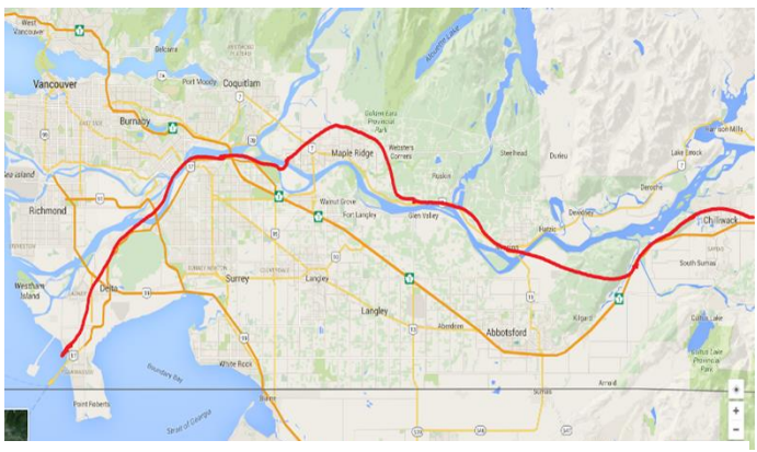
The thick red line indicates the area of the British Columbia lower mainland where it would be quicker to drive to Blaine to catch the Cascades than driving to downtown Vancouver.